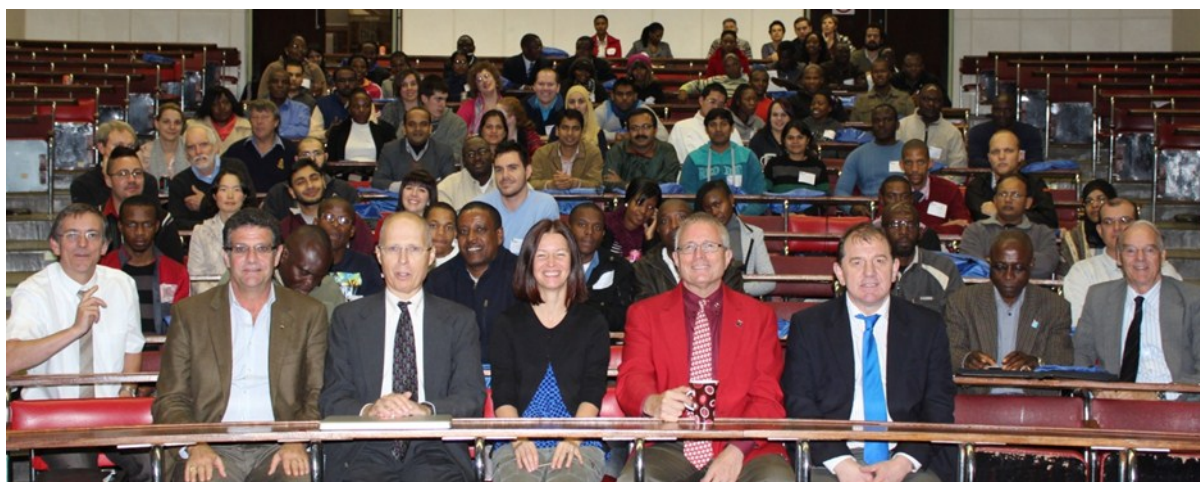
ACS on Campus event held at Wits